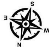
Crofton Park Av Approximate Gross Internal Floor Area 1176 sq. ft / 109.25 sq. m